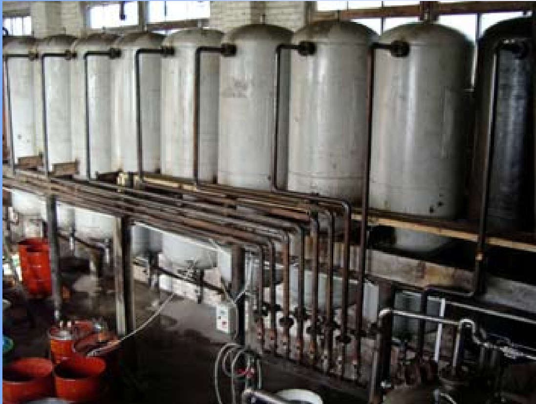
The installation in Jalgava, Latvia